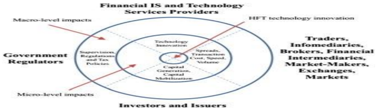
Fig: 1 – Stakeholders in the HFT technology ecosystem

Stage 5 (Identification of business infrastructure technologies). Finally, we must define the technologies which work together to increase the value for investors and other stakeholders on the global services platform in connection with services position technologies. Among other aspects, this range of technology can include ECNs, online social media assistance, and financial risk management systems. We will also expand this viewpoint on two issues: stakeholders and technology.