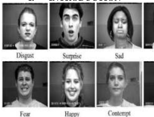
Figure 1. Facial Expression Emotion Recognition

Facial recognition technology is capable of matching a human face from a digital image or video frame against a database of faces. It is