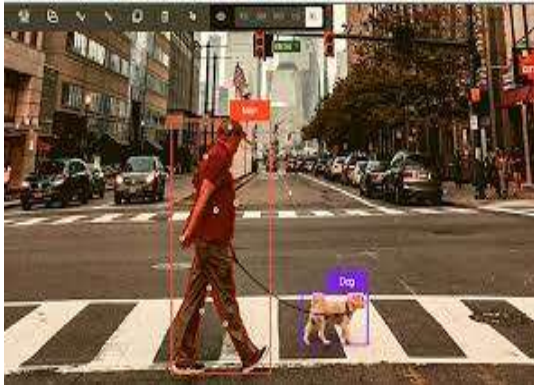
Figure 2. Image Recognition

Deep structured learning, commonly referred to as deep learning, is a type of machine learning that utilizes artificial neural networks with representation learning. This method can be supervised and has been applied to various fields such as computer vision, speech recognition, natural language processing, and more. Deep-learning architectures like deep neural networks, deep belief networks, deep reinforcement learning, recurrent neural networks, and convolutional neural networks have produced results comparable to and sometimes even surpassing human expert performance. While artificial neural networks were inspired by biological systems, they differ in that they tend to be static and symbolic, whereas biological brains are dynamic and analogue.