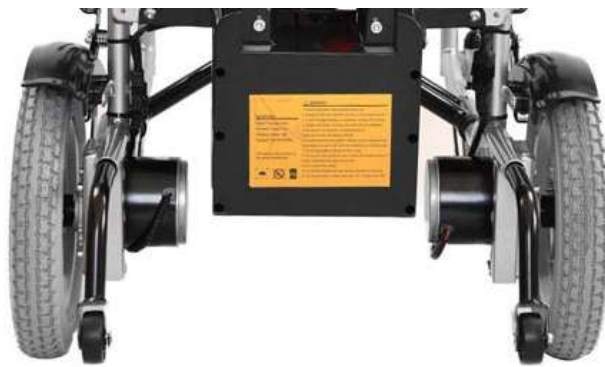
Fig 7. Motor & Battery Arrangement