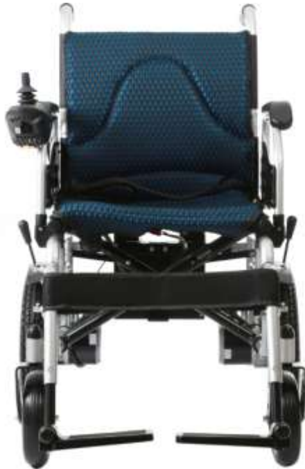
Fig 6. Motorized Wheelchair Scooter