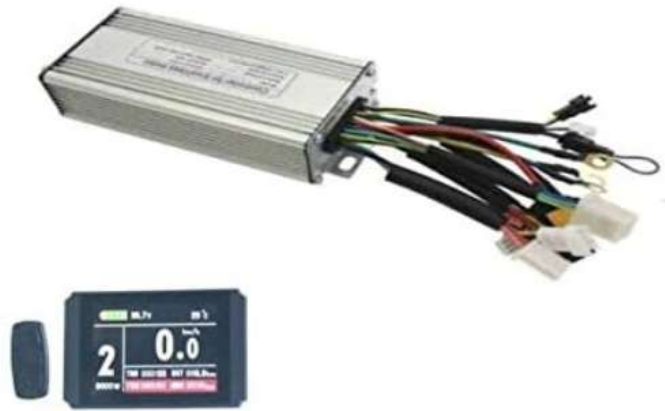
Fig 3. Controller Unit