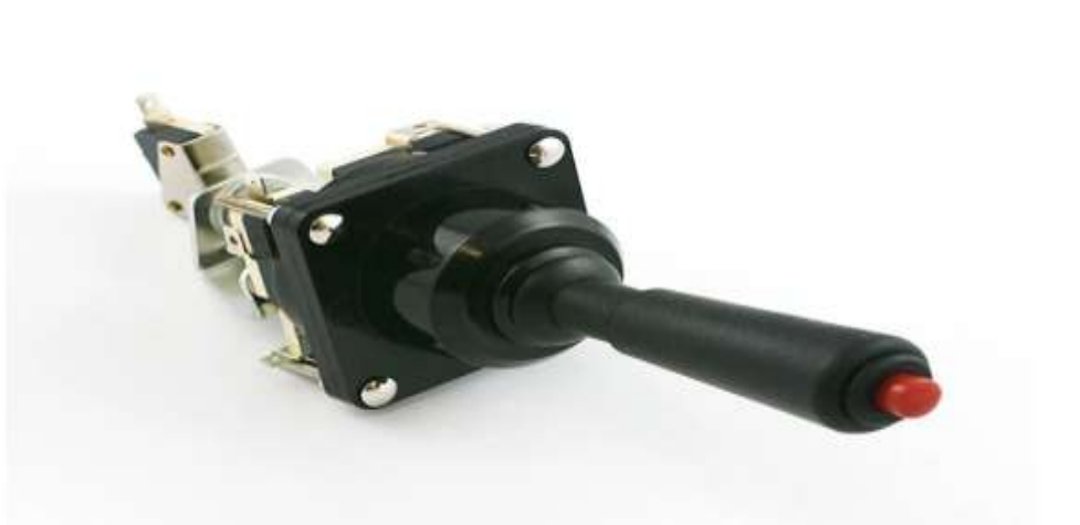
Fig 5. Intelligent Joystick

This joystick is pretty beefy and very tall because of it. We built up an enclosure just to see what it would look like. Ideally, this joystick would be panel mounted, but actually reading the movement of the joystick is as simple as setting up the microcontroller to read five switches.