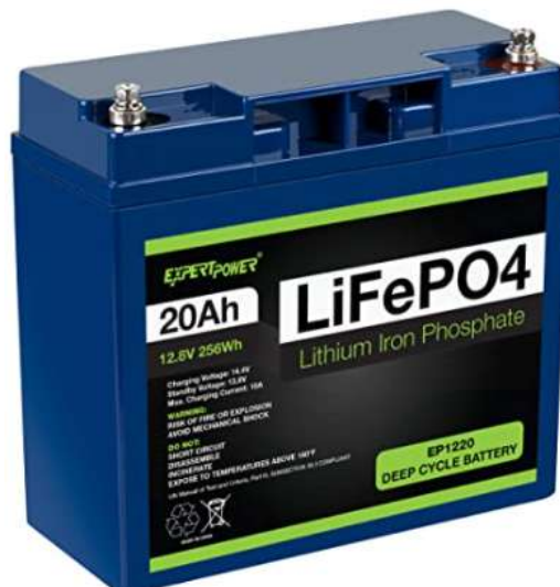
Fig 4. Battery Lifepo4 12 v 20 ah

disputable choice for rv's, marine and off-grid applications when towing or mobility is in the consideration. The lithium battery's unique built-in battery management system (bms) protects it from overcharge, deep discharge, overloading, overheating and short circuit, and excessive low self-discharge rate ensuring up to 1-year maintenance-free storage. Built-in low-temp cut off prevents charging under -5 °c.