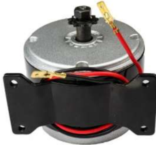
Fig 2. Motor

This DC motor is capable of rotation in either the clockwise or counter clockwise direction by just reversing the battery polarity to the motor and can be speed controlled.