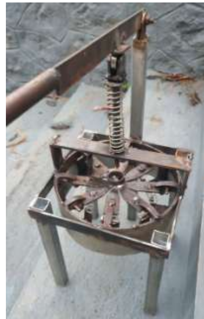
Fig 3.2. Fabricated Model