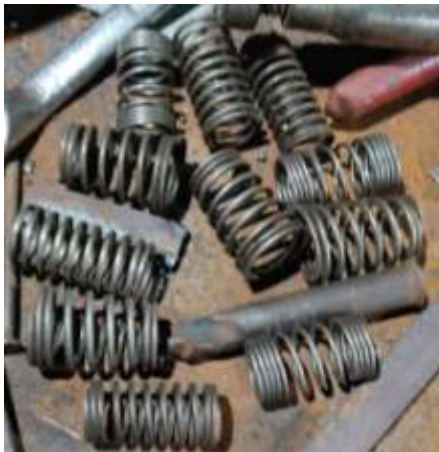
Fig 2.4. Compression Springs

It is used to give specific tension to cutting blade and cutting tool.