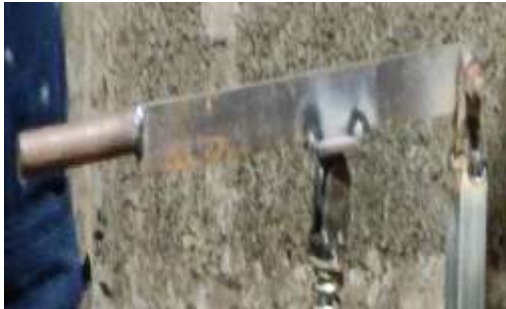
Fig 2.3. Lever