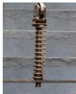
Fig 2.1. Cutting tool

It contains a sharp circular end, which will come in contact with the sap of the nutmeg. Thus it will remove the sap and also push the nutmeg through the cutting blades.