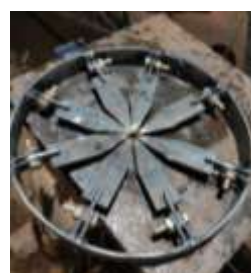
Fig 2.2. Cutting blades

They have soft edges so as it comes in contact with the nutmeg it will detach the mace safely along by the pushing force. Here there are eight cutting blades and are arranged in a circular shape so the space at the centre is a correct fit for the nutmeg.