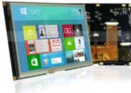
Figure 3. Front image of the display [7].