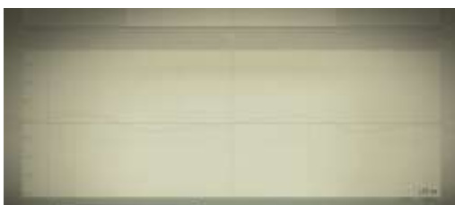
Figure 7. The sample output 2 of the device.