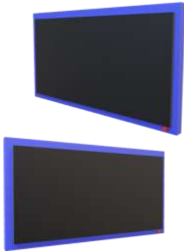
Figure 5. Shows side views of the device.

there is high voltage signal needs to be measure then use of other type of signal conditioner and voltage regulator is possible.