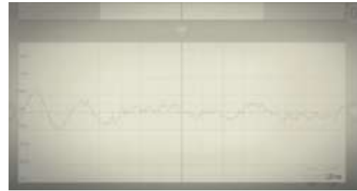
Figure 9. The sample output 4 of the device.

After installing the GUI onto the LPC1768 there is very minimum lag in its working when compared to the theoretical values. Apart from this, the device has accuracy same as the CRO (cathode ray oscilloscope). Distortion in the waveform can be a result of lose connection of its. Figures 6 - 9 show the sample outputs in the form of waveforms on the touch screen.