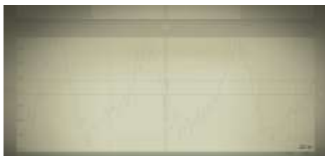
Figure 6. The sample output 1 of the device.