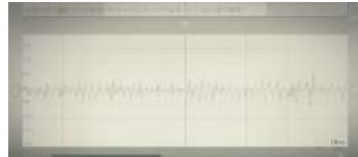
Figure 8. The sample output 3 of the device.