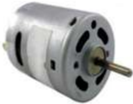
Fig.5 DC MOTOR

of internal mechanism, which is electronic or electromechanical. In both cases, the direction of current flow in part of the motor is changed periodically. A 12V DC motor is small and inexpensive, yet powerful enough to be used for many applications. A DC motor's speed can be controlled over a wide range, using either a variable supply voltage or by changing the strength of current in its field windings. Small DC motors are used in tools, toys, and appliances.