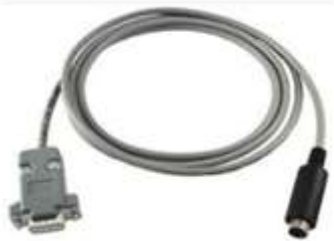
Fig.6 RS232 CABLE

RS232 is a standard protocol used for serial communication, it is used for connecting computer and its peripheral devices to allow serial data exchange between them. As it obtains the voltage for the path used for the data exchange between the devices. This cable supports both synchronous and asynchronous data transmission. In vending machine, this communication cable is used to connect computer and PLC where the ladder program in PC will be loaded into PLC using RS232 communication cable.