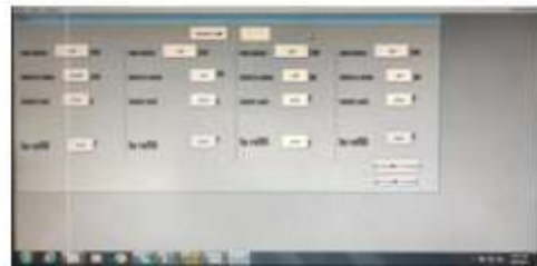
Fig.8 SCADA INTOUCH