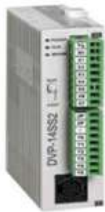
Fig.3 Delta PLC

IP address and port number also the station Id. We use program delta PLC using ladder logics like NO(Normally Open),NC(Normally Close) contacts and coils. Addressing for these coils are given based on instructions given in WPL soft.