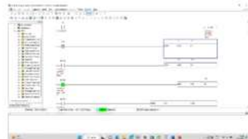
Fig.10 WPL SOFT