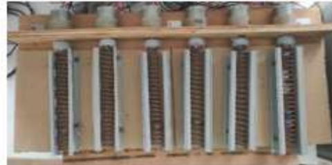
Fig.9 PROTOTYPE MODEL