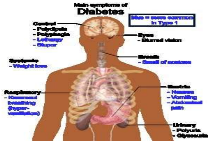
Figure 3 Overview of the most significant symptoms of diabetes