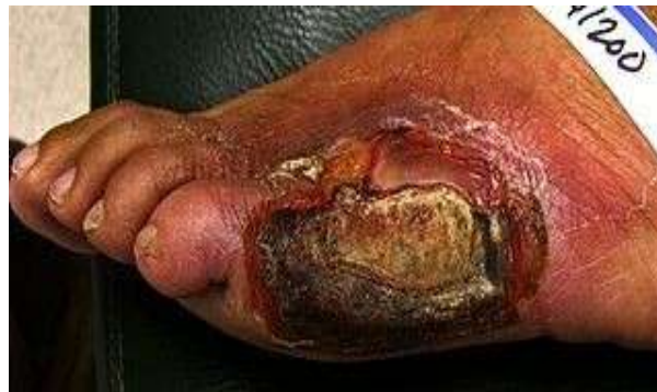
Figure 2 Foot ulcers are a common complication of diabetes and can lead to amputation. This ulcer is further complicated by both wet and dry gangrene.