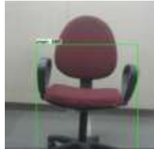
Fig. 1: Chair

Testing was done for different classes of same article for ex. PDA of 13 unique organizations were tried out of which five were identified precisely. Individual was distinguished effectively until distance of 12 feet's.