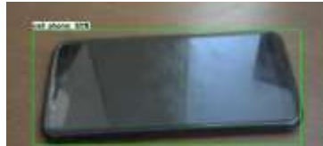
Fig 2: Mobile