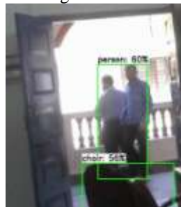
Fig 3: Person and Chair