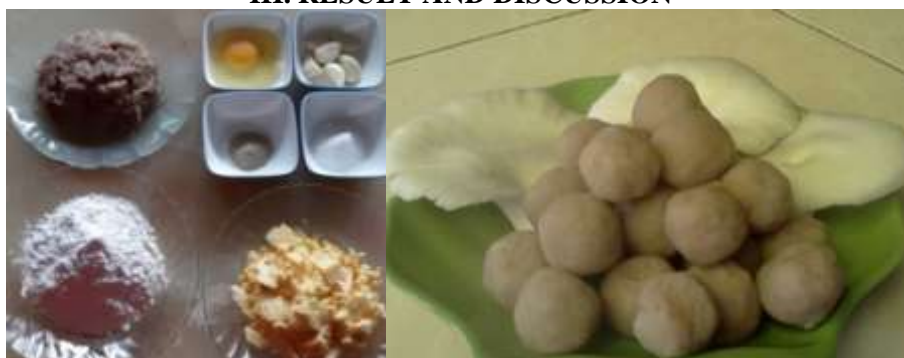
Figure 2. Ingredients for Oyster Mushroom Meatballs